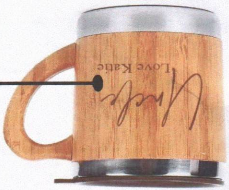
DSWD Logo here