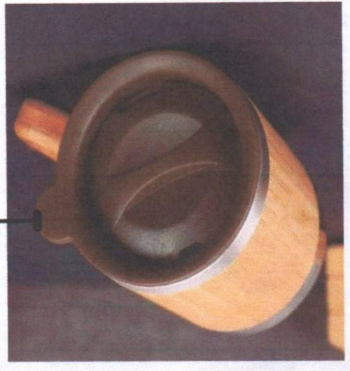
Mug Lid Cover (wooden or silicon)