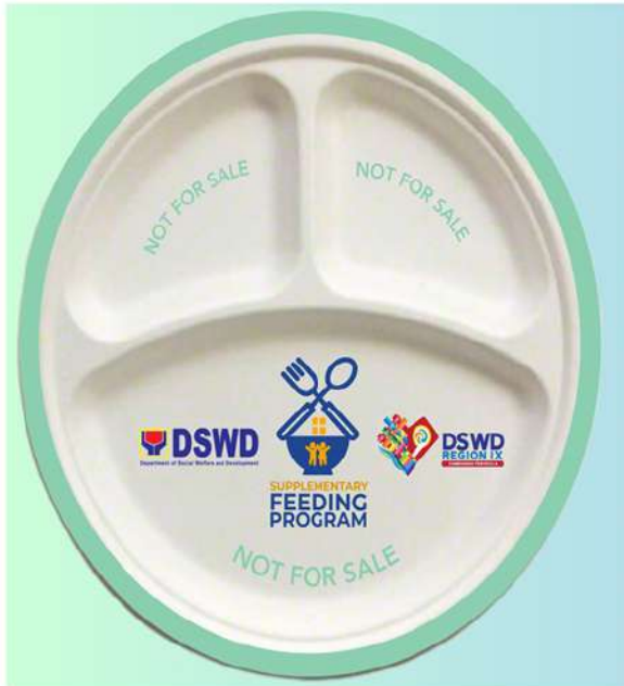
Plate with 3 Divisions

LENGTH: 9-10 INCHES WIDTH: 9-10 INCHES DEPTH: at least 0.5 INCH