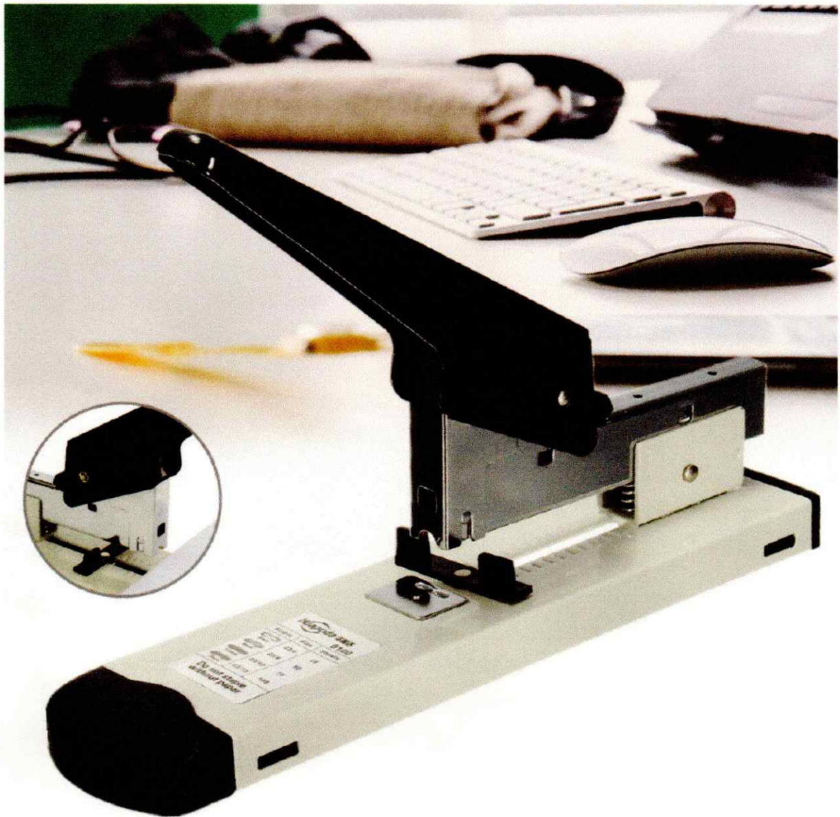
METAL STAPLER BOOKBINDING STAPLING 120 SHEETS CAPACITY WITH FREE 2 BXS STAPLE WIRE W(8CM) X L(29CM) X H(18CM) BLACK COLOR