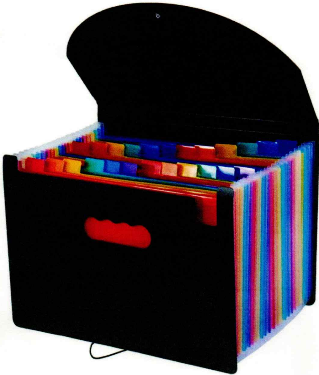
FILE ORGANIZER WITH EXPANDED COVER A4 LETTER SIZE 9.4H X 13.38 W