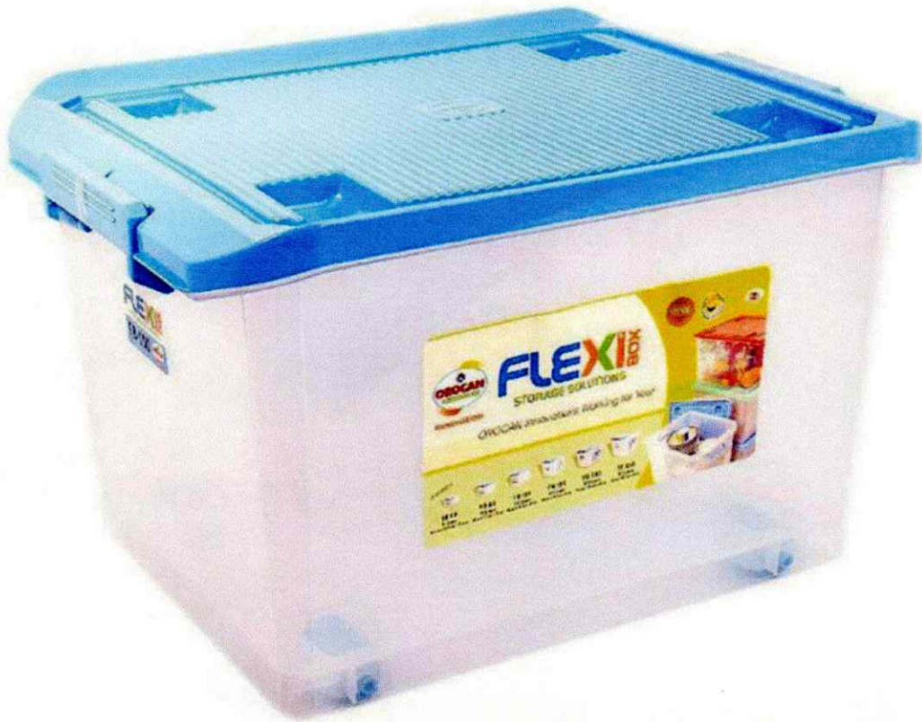
PLASTIC STORAGE BOX WITH COVER 87 LITERS L(68) X W(48) X H(40) CM TRANSPARENT COLOR