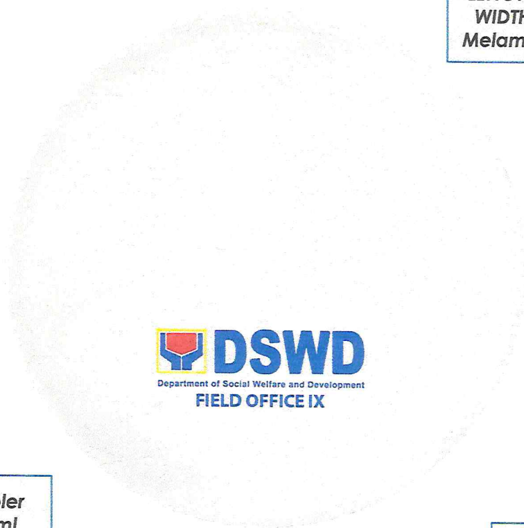
Plate with 3 Divisions LENGTH: 9 INCHES WIDTH: 9 INCHES Melamine material

Drinking tumbler at Least 350 ml Capacity Melamine material