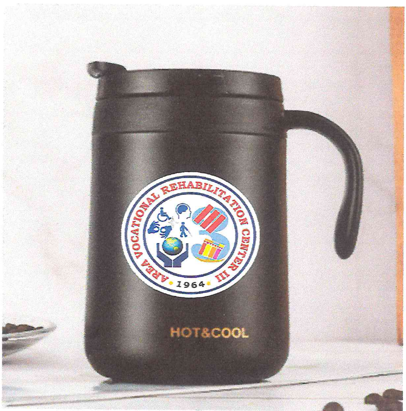
HOT AND COLD WATER TUMBLER (500 ML, HYDRO FLASK)